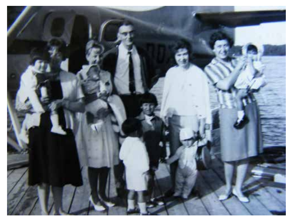
Anishinaabe children and CAS workers prepare to fly to northern communities, 1964.

Clearly, standards and practices of family life in Sandy Lake in the 1960s were different to what they are today. But even given this, several people observed that some adopted children suffered violence and abuse which went beyond usual expectations of hard work and